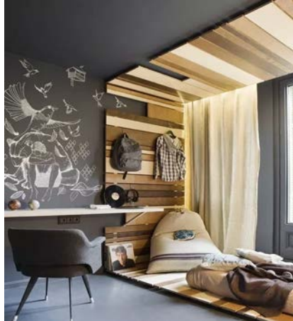
Fig.4 Color Matching in a Small Apartment Home Environment

The humanistic spirit of colors in household products among different users is mainly reflected in the fact that according to age and gender differences, through color settings, users can maintain a positive attitude and feel the inner joy brought by the family environment. [7] Taking the color matching of children's room as an example, the color saturation and brightness of household products in the children's room can be appropriately increased to increase the flexibility of the space. The children's study area can use light blue or light pink to create a warm and peaceful atmosphere for children's entertainment. The area can be used in orange, red or blue-purple to create an atmosphere of passionate movement. The color of children's space is more vivid, because children are more sensitive to colors than images, shapes, etc. at the age of children. Childhood is a beautiful period of colorful colors. A good home environment color helps children form a good psychology. .