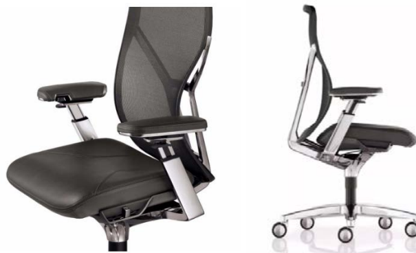
Fig.3 The Office Chair Designed by Studio Fifield

Different household products have different design standards according to the environment. For example, the sofa is relatively large and the filling material is soft, which is mainly used for lying and relaxing; most office chairs are soft in the middle and hard on both sides. In order to facilitate the movement, they are often equipped with pulleys. Wait. Based on ergonomics, the humanistic spirit is integrated into household products, and the ultimate goal is to improve some of the unfavorable factors that the environment brings to people, embodying people-oriented. [4] The office chair on wheels as shown in Fig. 3 is designed to cater to the size of the human body, emphasizing user-centeredness and material. Its characteristic is that the height of the bracket can be flexibly adjusted, allowing users to move freely and relax, which is a full embodiment of contemporary humanistic spirit in the design.