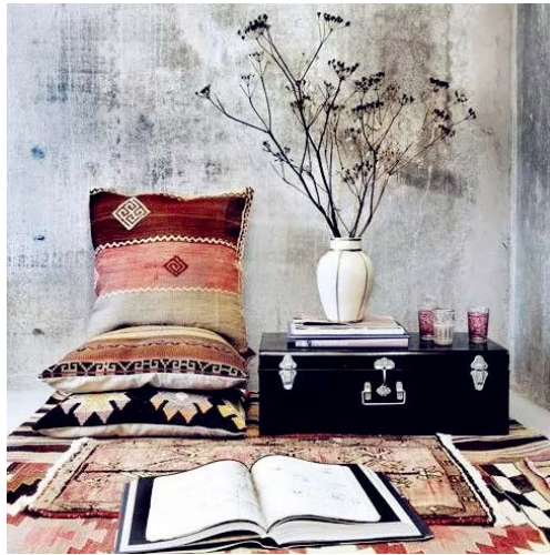
Fig.5 Lazy Fabric Sofa

Fig. 6 shows the soft bed design work of Ernesto Leto, Brazil. This model effectively blends material and color, and combines the two soft textures of yarn material and cotton in a clever way. Fabric cushioning The middle is filled with soft cotton, presenting a natural fall, increasing the layering and richness of the texture, and giving people a relaxed and free psychological feeling. Starting with soft materials, the artist explores tough materials that can express dreamy scenes, and the rendering of pink green and pink adds a certain sense of romance, and fully considers the placement, size, location, and color of the soft bed. Different effects produced by factors such as contrast. The green gauze is a slip-through made of yarn material that rotates around under the traction of a round rope. The pink cotton padding is very soft, people lie down naturally, like a huge bed, giving people a warm and comfortable feeling, the combination of different soft materials can increase the practicality and interactive functions, and arouse the sympathy of the experienter. It embodies the connotation of the humanistic spirit.