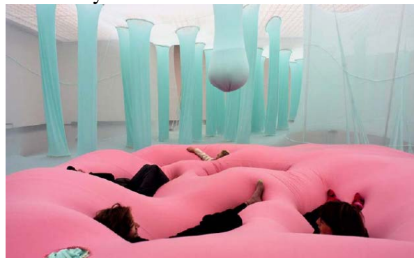
Fig.6 The Soft Bed Design of Ernesto Leto, Brazil

Therefore, the humanistic spirit in home furnishing materials is mainly reflected in the fact that people can enjoy the artistic conception of returning to the original through natural materials, and they can also feel the beauty of fashion brought by technological progress through artificial materials, and then perceive the vitality contained in the materials.