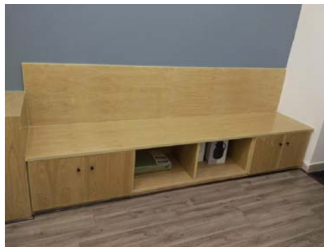
Fig.7 Card Seat Sofa

The humanistic spirit of the storage and flexible combination of household products is reflected in the fact that the storage and flexible combination of the home can save space and maximize the functionality of the storage home, which can improve people's quality of life and mood of use, and increase the happiness of life.