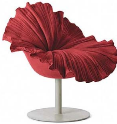
Fig.2 Petal Chair with Bionic Design