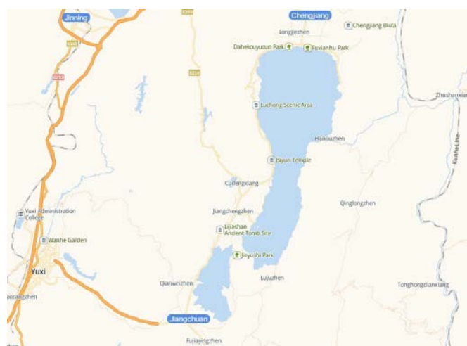
Figure 1 the Geographical Position of the Fuxian Lake Basin

The Fuxian Lake is situated in Yuxi City, Yunnan Province. It is the deep-water freshwater lake with the greatest water storage and also the only high-quality freshwater lake of China. The Fuxian Lake steps over Chengjiang, Jiangchuan, and Huaning, situated in the central part of five lakes(the Fuxian Lake, the Xingyun Lake, the Qilu Lake, Yangzong Lake, and Dianchi)(Figure 1). The basin has the strong environmental sensitivity. Once it is polluted, it is hard for governance or it is even irreversible. To sufficiently develop the ecological benefits, economic benefits, and social benefits of land-water resources and other natural resources, by regarding the basin as the research object, this thesis was based on the long-term planning, sufficiently developed various functions in the basin, and adapted to the natural economic law to capacity, trying to realize the maximum comprehensive benefits in the basin.