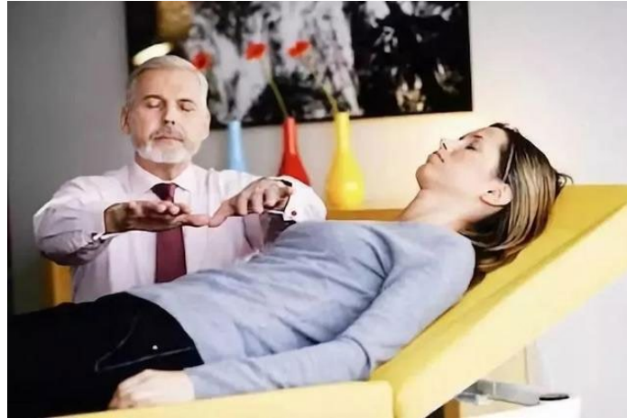
Figure 1 Traditional psychotherapy

Traditional psychotherapy emphasizes face-to-face communication between the psychologist and the patient in the same physical space. This type of communication helps build intimacy and allows the psychologist to better capture the patient's emotional experience; Figure 1 shows the traditional psychotherapy.