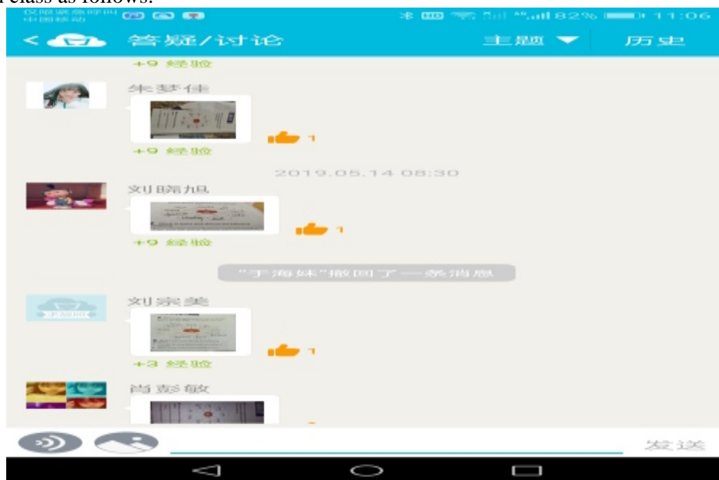
Figure 2 Students Share Their Results in Blue Ink Cloud Class

In the classroom activities, each group sends the questionnaire content to the discussion section of the Blue Cloud Class so that other group members can see it. Each group is presented orally by a student, other group members made suggestions. Suggestions from other group members were sent to the discussion area. In this process, teachers pay attention to students' suggestions, help students explain, analyze problems, reflect, and promote the sharing of tacit knowledge and the effective construction of new knowledge between groups. After the task is completed, the teacher will comment on the class and complete the immediate modification and feedback. The teams can also conduct competitions and submit reports at the required time. Teachers and students can jointly select the best survey report. In this process, cloud class provides a platform for the mutual evaluation between students and students. Teachers' immediate feedback on the tasks of each group of students and the sharing of feedback results are realized. Students use cloud classes to share their results in class as follows: