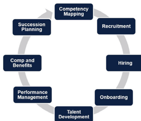
Figure 1 Talent information integration management network structure system

According to the progressive relationship of professional knowledge, the experimental teaching of national economic management specialty consists of basic experiment, course experiment and comprehensive experiment. Knowledge and technological innovation, as two main driving forces, need to cultivate financial management talents with good scientific and cultural literacy, solid professional foundation, strong self-learning ability and innovative ability. Figure 1 is the network structure system of talent information fusion management.