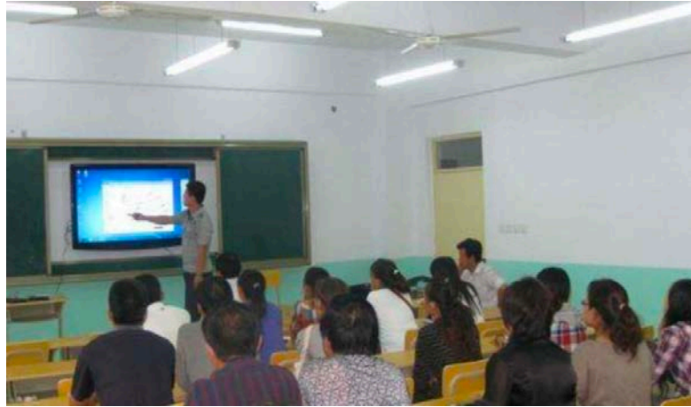
Figure 1 Teaching activities