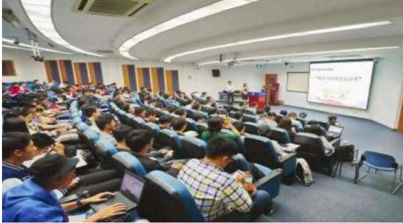
Figure 2 Ideological and political courses