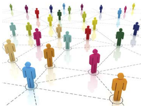
Figure 3 Content compilation of self media account

The information dissemination function of self media itself is obvious, so ideological and political educators should actively study and use self media to carry out the corresponding ideological and political education work, which can effectively shorten the relationship between the school and students, and at the same time, can show the originally boring ideological and political education content in front of students in a vivid way. Students can also use the self media platform to comment, forward and other functions to discuss specific issues. The construction of the self media platform can also introduce the participation of students, so that students can have a deep understanding of the operation mode of self media, and let students communicate and discuss in the actual work, so as to improve the social ability of students. In the self media platform article writing work, teachers can start with the title first, because a good title can often play a finishing point role. So it can not only attract students to read, but also play a role in Ideological and political education.