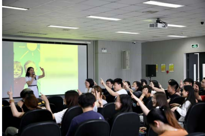
Figure 2 Self media

The self media carried by the Internet promotes the communication between people. At the same time, due to the connectivity of the self media itself, individuals can form a connection through the self media platform and complete social activities. The six degree segmentation theory proposed by foreign scholars, that is, the distance between a person and any stranger, will not exceed five. Therefore, for making friends, through the use of self-Media attention, reply, forwarding and other functions can achieve relatively ideal social effects, students can establish a certain connection with strangers who have the same hobbies, and get social belonging management from it, the limitations of human-to-human communication are completely broken, and the human-computer communication ability of students can also be exercised.