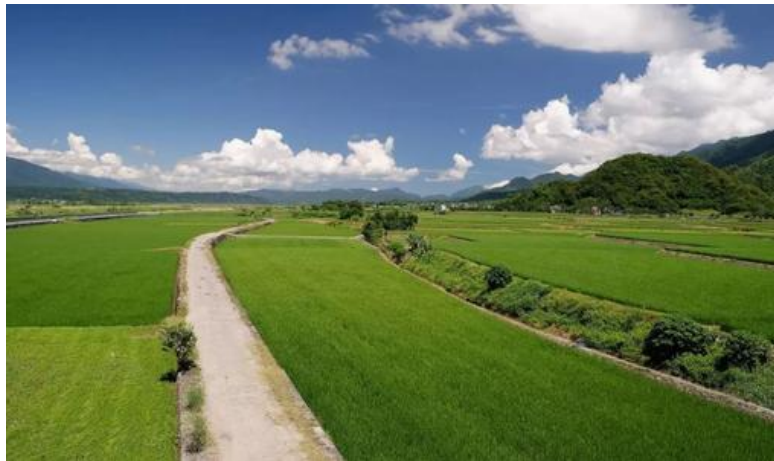
Figure 3 Agricultural transfer

Therefore, in order to promote the development process of agricultural modernization, it is very important to effectively implement the citizenization of agricultural transfer population. Relevant workers must correctly realize that the citizenization of agricultural transfer population needs to be carried out in a long-term and systematic way. The existing relevant laws and regulations should be adjusted and improved in real time through the continuous establishment of relevant legal norms for the citizenization of the whole agricultural transfer population. Legal measures should be taken to strengthen the protection of the legitimate labor rights and interests of farmers, promote the process of citizenization of farmers, effectively transform the policies advocated by the state into reliable laws and regulations, implement the legislative work in housing, work, household registration, education and medical care, labor employment in housing, social security, urban household registration, education and medical care, labor employment, etc., and accelerate the transfer of agricultural people. The process of citizenization.