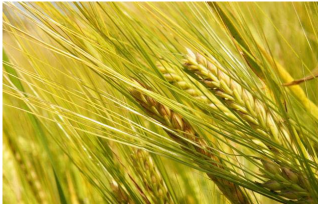
Figure 2 Agriculture