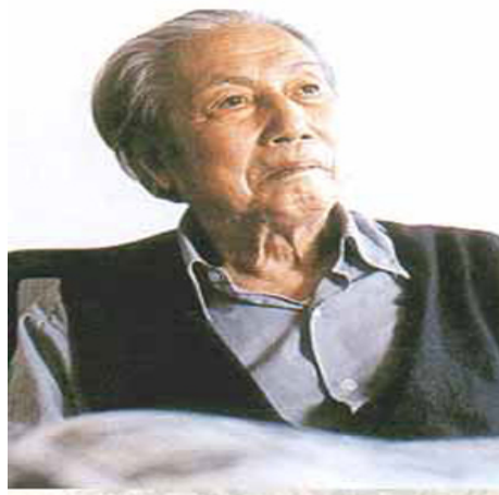
Figure 1 Mr. Lu Yanshao's portrait in his later years.

once served as the academic administrator of Jiangxi Province from 1855 to 1941). In his youth, he traveled to the north and south of the Yangtze River, read thousands of books and traveled thousands of miles; in his middle age, he experienced a period of war and turmoil, uprooted and weathered from hardships; eventually in his later years, he was highly respected and fruitful. Lu Yanshao was a rare master of literati painting in modern China. The tradition of Chinese literati painting has a history of thousands of years. The integration of poetry, calligraphy and painting is the unique artistic and aesthetic fashion of the Chinese nation. Lu Yanshao is no doubt a master of the contemporary Chinese literati painting. He was the former president of Zhejiang Painting Academy and a professor of Zhejiang Arts Academy. His representative works include Album of One Hundred Poetic Settings from Du Fu's Lines, Xiajiang Painting Scroll, Jinggangshan Wushaokou Painting Scroll, Leaving Baidi under Rosy Morning Clouds, and Sixteen Settings of Motherland. Lu Yanshao has made numerous paintings in his life. He has devoted his whole life to no social intercourse. Most people know the paintings before the painter himself.