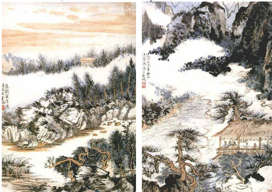
Figure 6 Pieces from Album of One Hundred Poetic Settings from Du Fu’s Lines .

addition, subtraction, and interpolation.” In Album of One Hundred Poetic Settings from Du Fu’s Lines , Lu Yanshao blended of the North and South Style without a trace, interspersed with the use of various wrinkle methods, and established his own style.