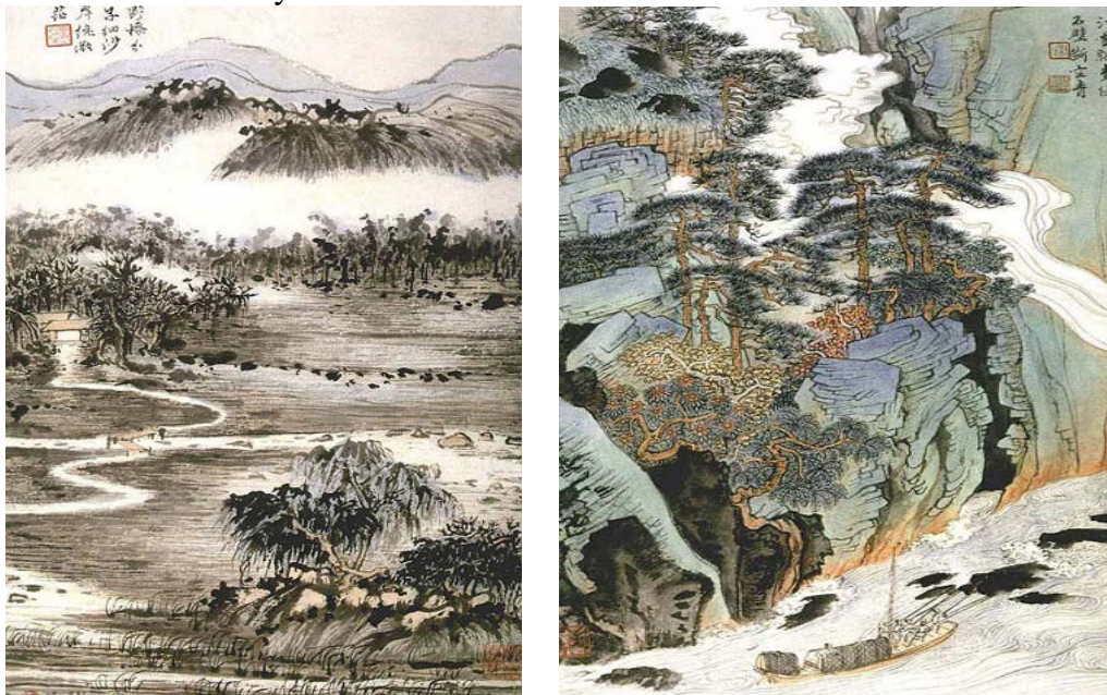
Figure 2 Pieces from Album of One Hundred Poetic Settings from Du Fu’s Lines.