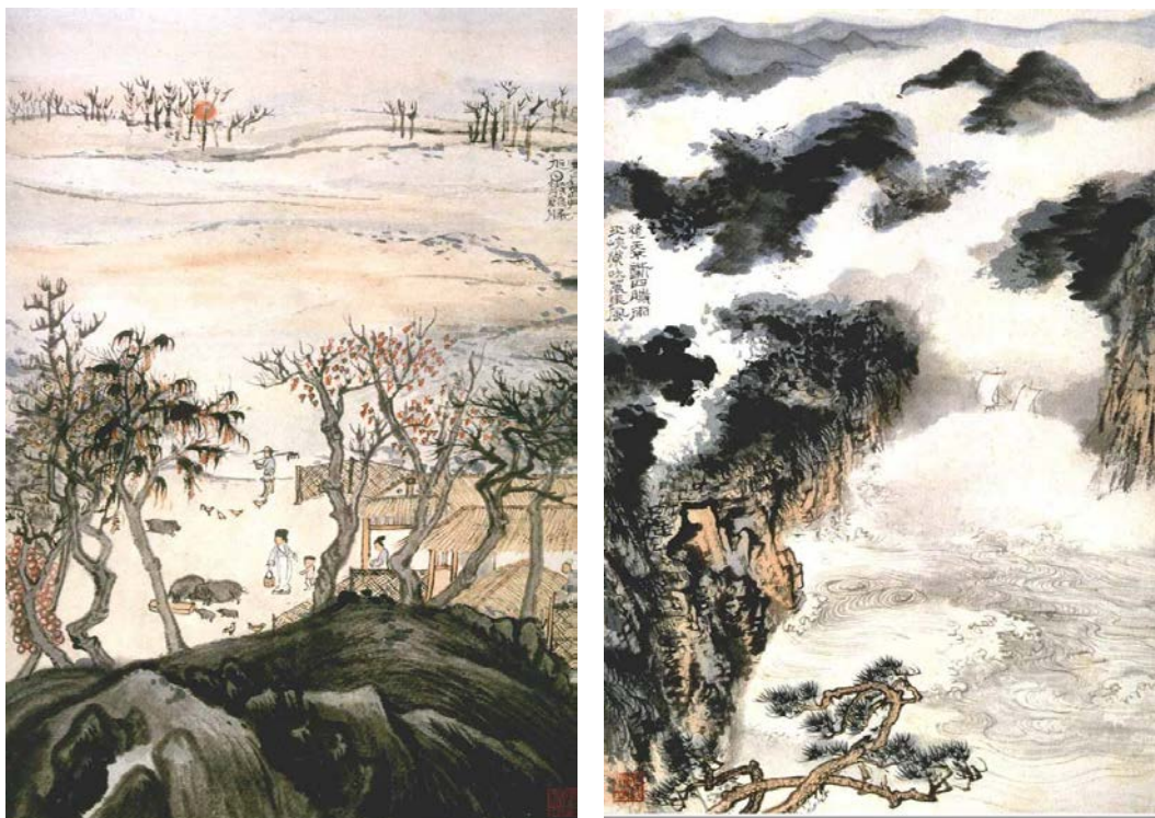
Figure 5 Pieces from Album of One Hundred Poetic Settings from Du Fu's Lines.

4.2 Style Features: Lu Yanshao's Album of One Hundred Poetic Settings from Du Fu's Lines can be said to be integrated with the advantages of traditional techniques of the past dynasties and in-depth study of the styles of various schools, and absorbed the essence of ancient and modern Chinese and foreign art. The pictures in the album are quite unique, which makes the audience marvel. Among the hundreds of folios that Lu Yanshao painted in his life, 26 of them made the Selected Album of Lu Yanshao published by Shanghai Calligraphy and Painting Publishing House. The contents involve poems of Tang and Song Dynasties, Mao Zedong's poems, travel essays about mountains and rivers, flowers and birds, and figures. However, there are no more than 20 or 30 albums in each volume. Only Du Fu's poetry has the large volume, showing his unique strength.