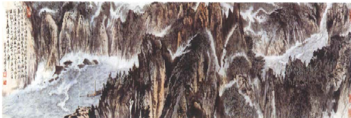
Figure 3 Xiajiang Scroll.

poems were his inspiration. Lu Yanshao selected the scenery in Du Fu's poems from the perspective of a painter. The trip was well worth it. He has indeed made a contribution that no ordinary painters can do: painting Album of One Hundred Poetic Settings from Du Fu's Lines and Lu's landscape.