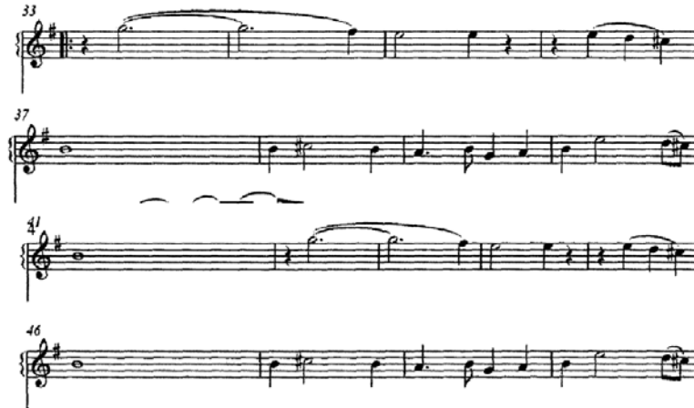
Fig. 1 Examples of music scores

techniques and musical foundation theories as well as teaching ability.