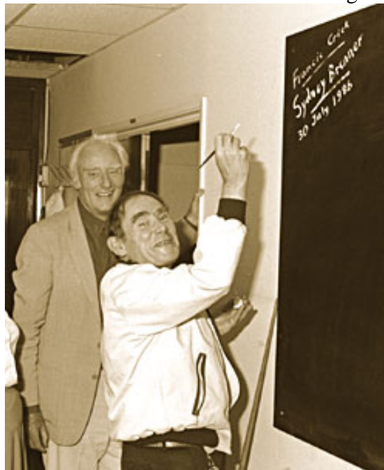
Fig.3: Francis Crick and His Second Collaborator Sydney Brenner

All he focused on involves two-level research that was indication of his efforts in genetic codes. The first level includes his fundamentals such as coding problem, protein synthesis and triplet, while the second is made of the syntheses with the properties of genetic code, wobble hypothesis, stop codons, the construction of the standard code table and the origin and evolution of codes [23,24] .