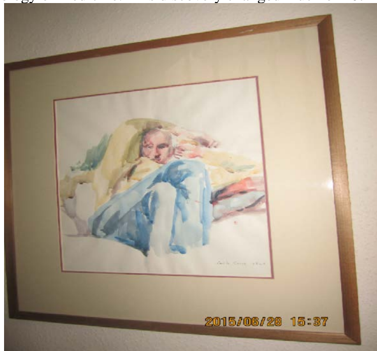
Fig.1: Crick in Contemplation

Francis crick (figure 1) was born on June 8, 1916 as an English citizen, and he left the world, aged 88. With lifelong devotion to scientific research, crick is credited as one of the central figures in the molecular revolution that swept through biology in the latter half of the twentieth century [1] . Keen on seeking after and tackling the profound problems, he developed a passion for biology although crick did research in physics at the beginning of his scientific life [2,3] . Having with James Watson discovered the structure of deoxyribonucleic acid [4] , in 1962 crick won him a share in the Nobel Prize in physiology or medicine. This discovery changed much of 20th century science.