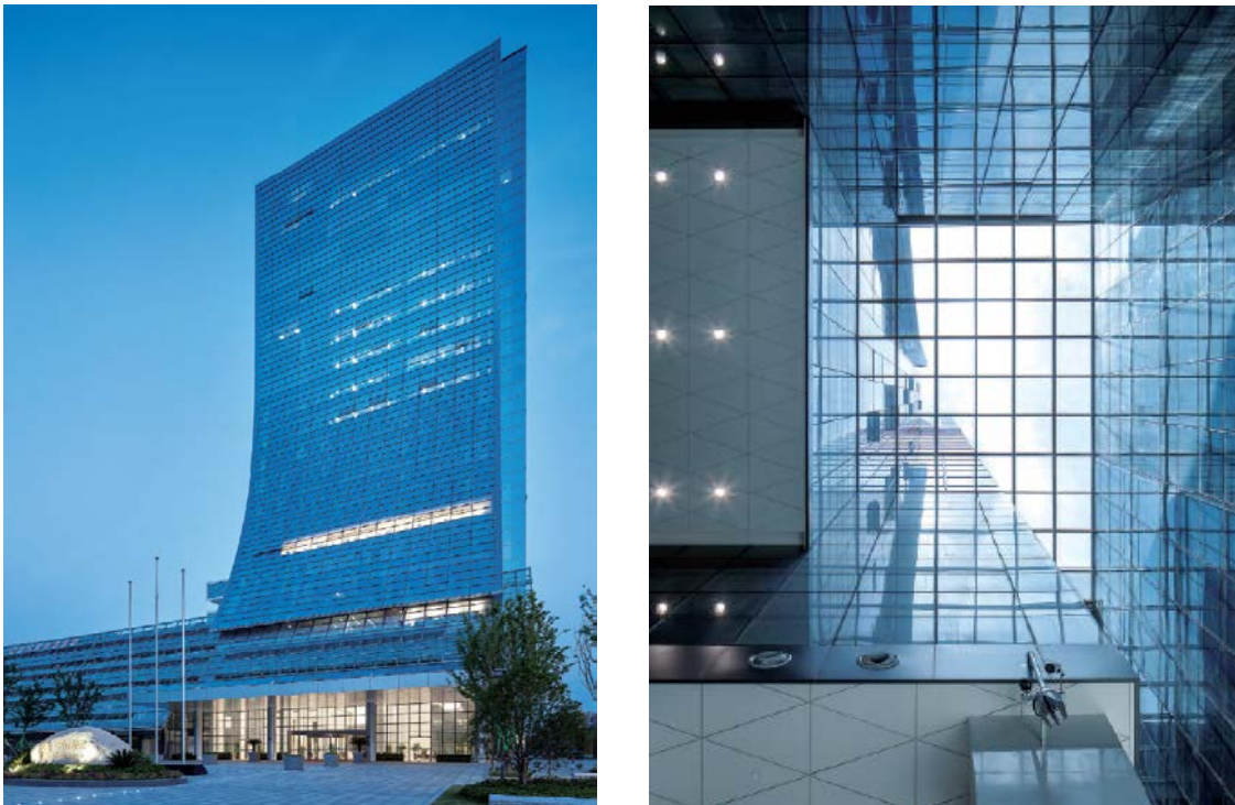
Figure.3 Design of curtain wall and spatial organization of mobile office building