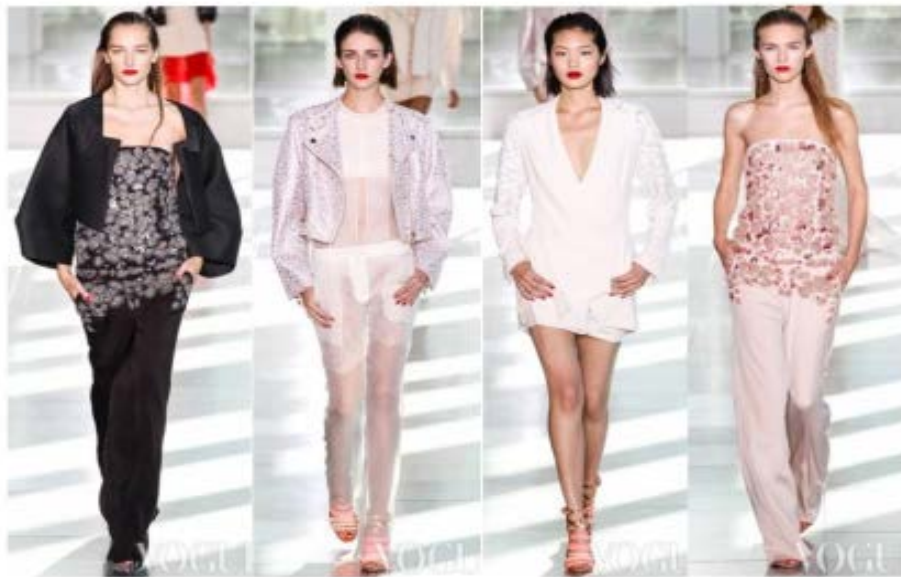
Fig.2. Antonio Berardi Spring/Summer2014

Antonio Berardi 2014 spring/summer fashion show highlighted the innovation of unisex elements through the use of unisex elements, clean cutting, shirt collar design and men's structure design, further expressed the development of unisex style in the fashion trend, as shown in Figure 2.