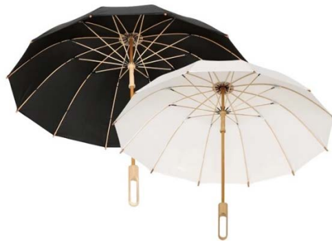
Figure 1. The Zhuyu Umbrella

expand the influence of Fenshui oil-paper umbrella and distinguish it from other Chinese style umbrellas? The answer is to seize local culture and innovatively design an umbrella with Sichuan characteristics.