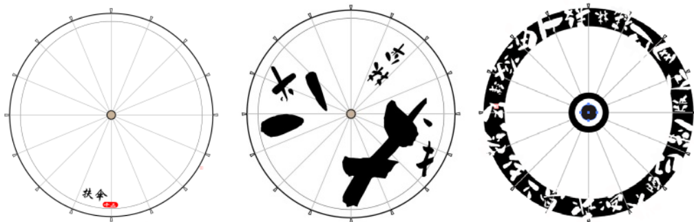
Figure 5. Patterns on Umbrella Cover

Fenshui oil-paper umbrella has two characteristic crafts: lithography and threading. But it is difficult for them to integrate into modern design and production. Therefore, we extracted the overall shape of oil-paper umbrellas, using multiple umbrella bones to reproduce the feeling of oil-paper umbrella, and selecting bamboo as the main material. “Bamboo is the symbol of noble character.” Bamboo bears traditional aesthetic meaning in China. It has already surpassed the meaning of the object itself, and becomes a carrier of ideas and a symbol of culture. [6] The bamboo is also a representative material of China. At the same time, we chose the names of some umbrella making craft, such as Fusan, thread, lithograph and edge taping. After deconstruction and reorganization of the font and size, the characters became small, red seal patterns and were printed on the umbrella cover (Figure 5). The skill of Fenshui oil paper umbrella is directly transmitted. The panda bamboo umbrellas have big ones and small ones. They can be used as the family umbrella for adults and children. It contains the meaning of family reunion, as well as the wish of “the more sons, the more happiness.”