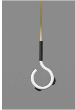
Figure 6. Umbrella Handle for Adults Figure 7. Umbrella Handle for Kids