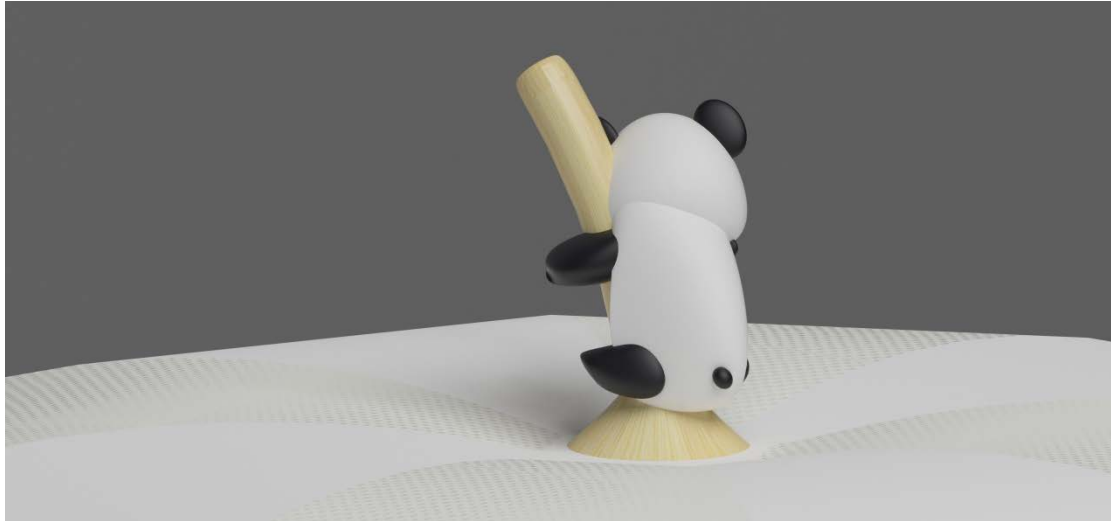
Figure 4. Panda on the Umbrella Tail