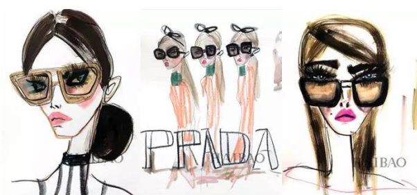
Figure3 Prada glasses series