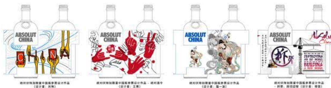
Figure 4 Absolute Vodka Limited Chinese Bottle