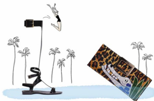
Figure 2 Roger vivier 2012 spring and summer new products

Fashion illustrations can present the content of goods and information to people in a very intuitive and visual way, and spread the artistic appeal of beauty. Its unique style of creation plays an important role in current visual communication design. The creativity and visual beauty of fashion illustrations often attract the general public. Fashion themes and visual elements convey the product information to the viewers inadvertently, which will not cause consumers to resist and dislike when watching the advertisements [3] . On the contrary, people make a deeper impression on it. The most significant advantage of fashion illustration design in advertising is that it can quickly distinguish the differences of products of different brands, effectively innovate people's buying interest, convey the information and brand culture of goods, and satisfy people's spiritual needs while purchasing goods. On a global scale, mainstream consumer brands recognize the unique artistic connotation and value of fashion illustrations, and use them in advertising and publicity. The publicity effect obtained is very significant, which not only enhances product sales, but also promotes brand influence in the industry. And the competitiveness has been further improved. For example, mainstream brands in different fields such as Coca-Cola, Roger vivier, Prada, GUCCI, Adidas, Hermes, Absolut Vodka, etc. all use fashion illustrations as one of the important ways of brand advertising.