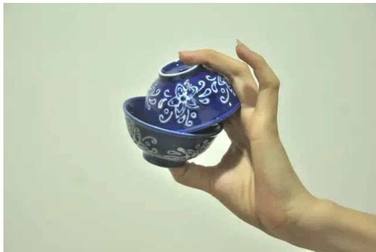
Figure.2 The unique performance props of Xingning cup flower dance

The unique performance props of Xingning cup flower dance are cups, as shown in Figure. 2. The performer can make people feel pleasant by tapping the cup and making a crisp and pleasant sound; the tapping of the cup has a distinct rhythm, and there are allegro, slow board, drag board, etc., which emits a varied rhythm, usually in the cup of flower dance, the sound of the cup is slow, sometimes fast, sometimes short and crisp, sometimes continuous and melodious, enriching the dance music to a certain extent[8]. The use of dance props can enrich the dance vocabulary and increase the skill of the performance. The dancers used the tapping dance cups to make a crisp and sweet, cup-like sound that made the whole dance atmosphere happy and exciting. In order to make the actors dance freely, the dance cadres of the Xingning culture center reformed the cups, drilled a small hole in the bottom of the cup, and fastened the cups so that the performers could easily and quickly sculpt the cups. The rhythm makes the dance more cheerful and fully reflects the charm of the cup.