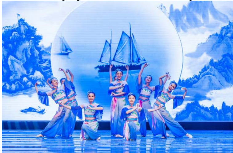
Figure.3 Extraordinarily powerful of cup flower dance

formation change, character modeling, silhouette and freeze frame to enhance the artistic appeal, as shown in Figure.3. Due to the changeable rhythm of music, dancers need to coordinate the rhythm and dance steps of hitting the cup, and the dance movement should also do a lot of quick and slow processing in speed[3]. In the composition of dance, cup flower dance is extremely rich in both the movement line of dancers in the stage space and the screen modeling.