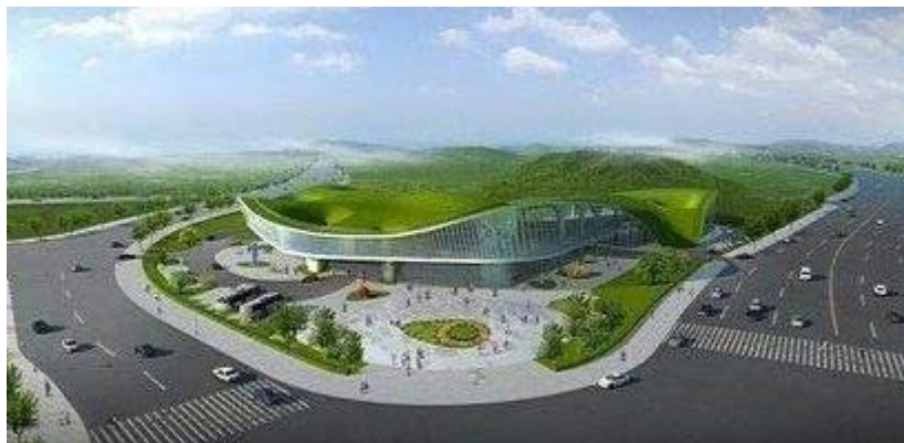
Fig.2 The effect diagram of high-rise building design under an ecological architecture